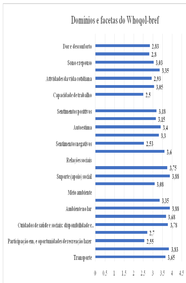
Graph 2. Descriptive statistics of the WHOQOL-bref facets, João Pessoa, 2017.

domain; "Spirituality / religion / personal beliefs" (3.60) and "Negative feelings" (2,53) for the "Psychological" domain; "Social support" (3.83) and "Sexual activity" (3.08) for the domain "Social relations"; and "Environment in the home" (3.88) and "Participation in, and recreation / leisure opportunities" (2,55) for the "Environment" domain (Graph 2).